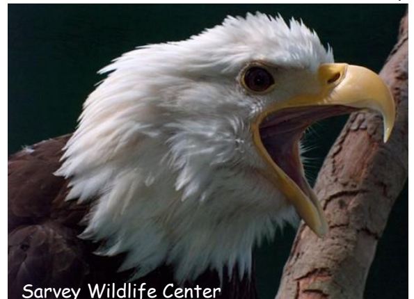
Sarvey Wildlife Center

The Sarvey Wildlife Care Center , formed in 1981, is a non-profit organization dedicated to the care and rehabilitation of injured and orphaned wild animals. The Center is staffed entirely by volunteers and funded by donations from the public, and rehabilitates approximately 3700 birds and mammals a year - everything from Bald Eagles to hummingbirds and Cougars to Flying Squirrels. The birds of prey involved in this presentation are non-releasable due to injuries. Their handlers will explain their unique physical characteristics, breeding habits, and habitats in the wild. The amphitheater is on the east side of the Frances Anderson Center.